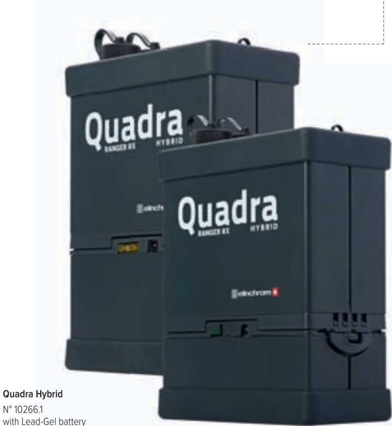
Quadra Hybrid N° 10266.1 with Lead-Gel battery

Family With the EL-Reflector Adapter all accessories and Rotalux softboxes up to 135 cm can be used.